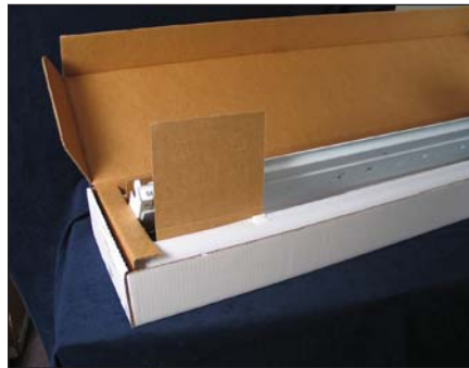
Step 8: Insert the puff wrap into the inner pack folder and position it flat on the bottom of the inner pack folder.