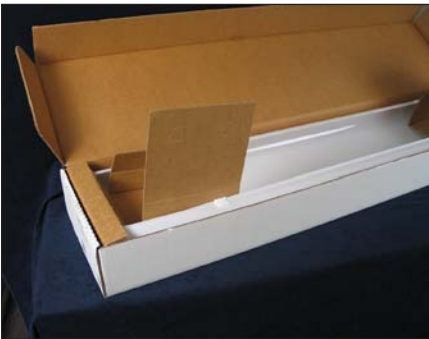
Step 7: Open the small and large wrap flaps so the wrap fixture can be inserted into the inner pack folder.