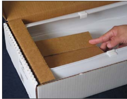
Step 5: The wrap end wall of the inner pack should be in a vertical orientation.