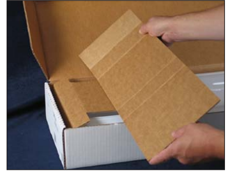
Step 3: Place the outer flap of the inner pack between the end of the puff diffuser & the end of the carton.