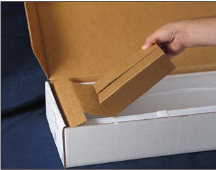
Step 4: Fold the large wrap flap & the small wrap flap in towards the center of the puff and fold the wrap section of the inner pack into the puff diffuser.