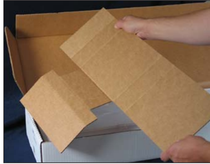
Step 2: Locate the outer flap and orient the inner pack folder approximately as shown.