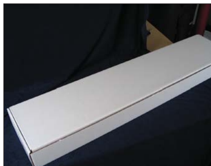
Step 11: Re-close the puff (outer) carton & secure with tape, or other appropriate means.