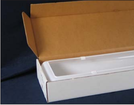
Step 1: Open the Puff Outer Carton.