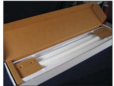
Step 9: Fold the large wrap flap onto the wrap fixture & cover that with the small wrap flap. Position the flaps securely as possible.