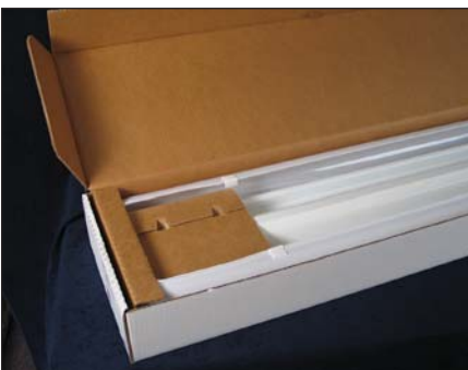
Step 10: Push the wrap flap retainer locking tabs found on the small wrap flap into the matching retainer holes in the large wrap flap.