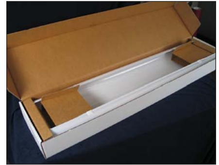
Step 6: Both sides must be packed in tandem when inserting the wrap fixture - be sure to insert an inner pack at each end before inserting the wrap fixture.